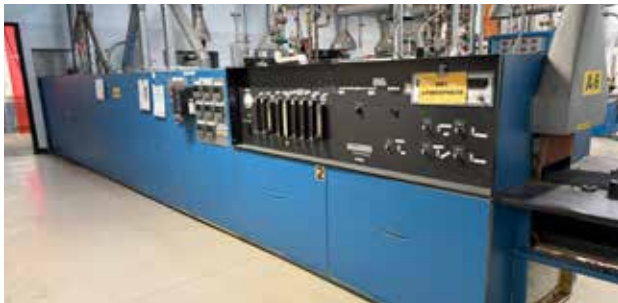
PLATE & FRAME FILTER PRESSES

PARKSON PRESS, MODEL AFP-630-100, 24.8" X 24.8" PLATES, CAKE CAPACITY: 6 CU FT, SURFACE AREA: 64 SQ FT, S/N 80083902