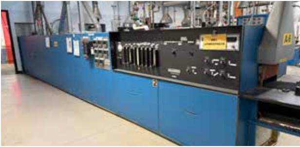
PLATE & FRAME FILTER PRESSES

PARKSON PRESS, MODEL AFP-630-100, 24.8" X 24.8" PLATES, CAKE CAPACITY: 6 CU FT, SURFACE AREA: 64 SQ FT, S/N 80083902