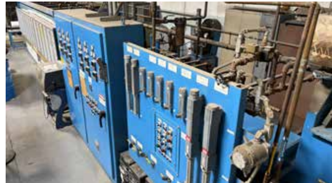
PLATE & FRAME FILTER PRESSES

PARKSON PRESS, MODEL AFP-630-100, 24.8" X 24.8" PLATES, CAKE CAPACITY: 6 CU FT, SURFACE AREA: 64 SQ FT, S/N 80083902