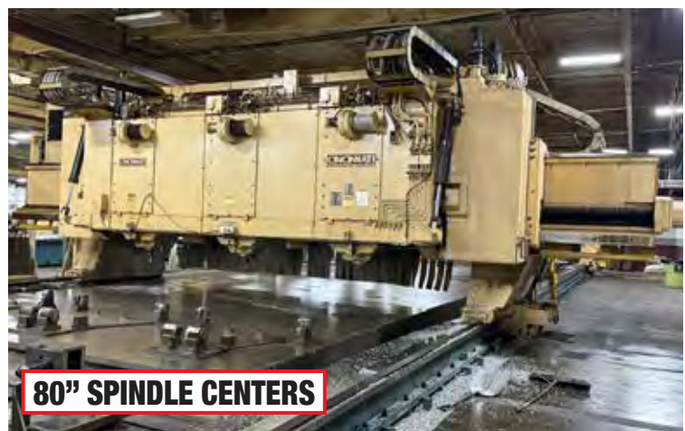
80" SPINDLE CENTERS