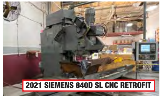
2021 SIEMENS 840D SL CNC RETROFIT