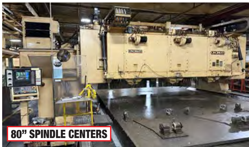
80" SPINDLE CENTERS