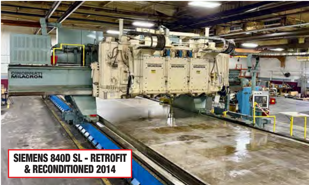
SIEMENS 840D SL - RETROFIT & RECONDITIONED 2014