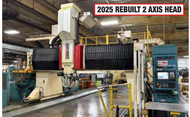
2025 REBUILT 2 AXIS HEAD