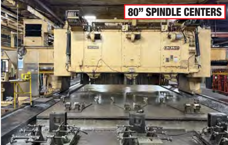
80" SPINDLE CENTERS

LOCATION: 9301 MASON AVENUE, CHATSWORTH, CA 91311