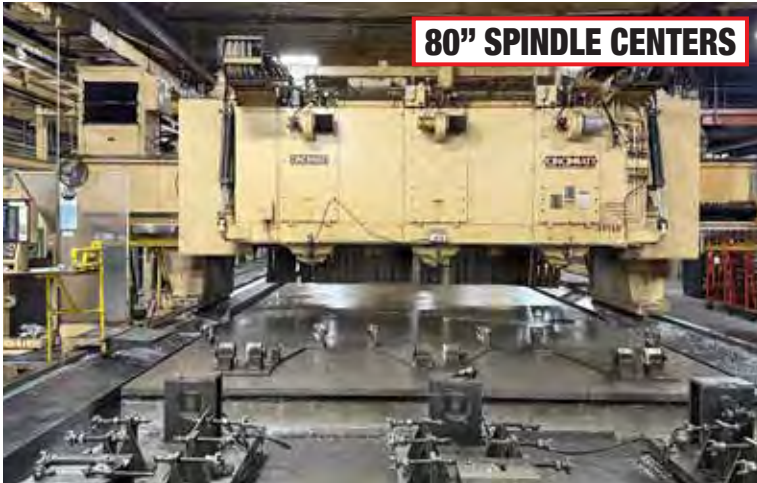
80" SPINDLE CENTERS

LOCATION: 9301 MASON AVENUE, CHATSWORTH, CA 91311