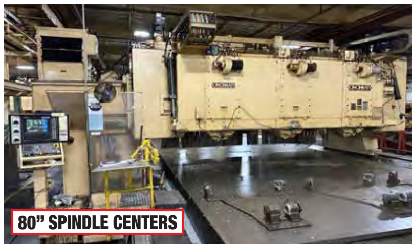
80" SPINDLE CENTERS