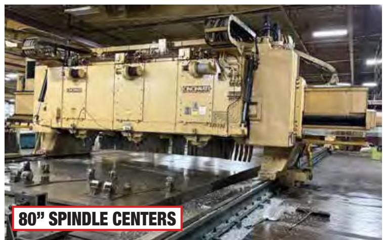
80" SPINDLE CENTERS