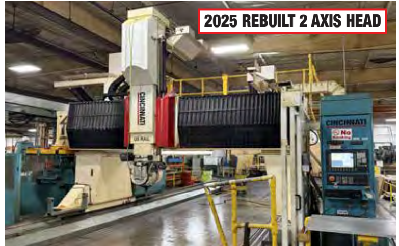
2025 REBUILT 2 AXIS HEAD