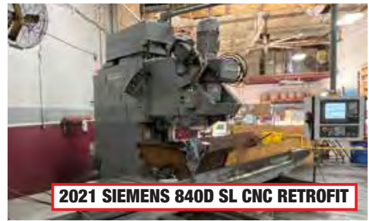
2021 SIEMENS 840D SL CNC RETROFIT