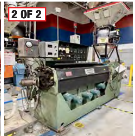
2 OF 2