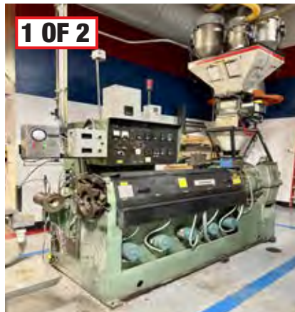
1 OF 2