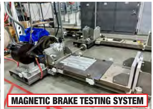
MAGNETIC BRAKE TESTING SYSTEM