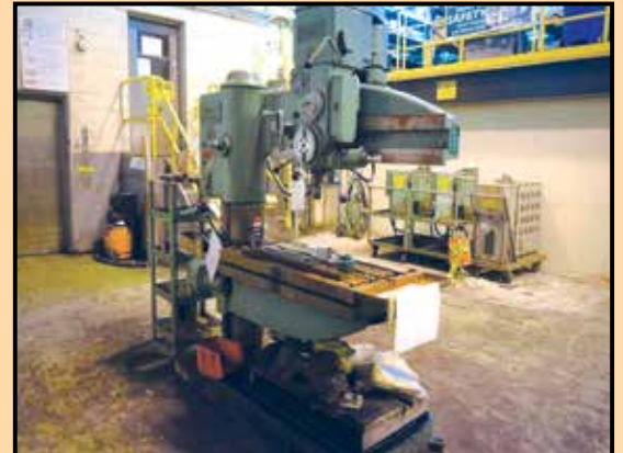
FOSDICK 4' X 13" Radial Arm Drill