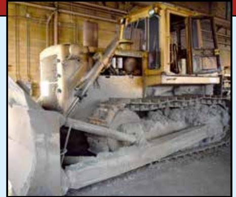
DRESSER TD-25G Crawler Dozer