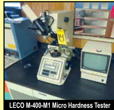
LECO M-400-M1 Micro Hardness Tester

Please Note: This facility may be subject to a sale in its entirety and if confirmed will be removed from the Auction Schedule