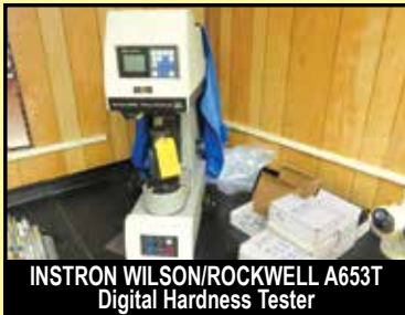
INSTRON WILSON/ROCKWELL A653T Digital Hardness Tester

#1 – TITUS (PA) Sale: Friday, October 4th – Thursday, October 10th • Inspection: Friday, October 4th from 9:00AM-2:00PM