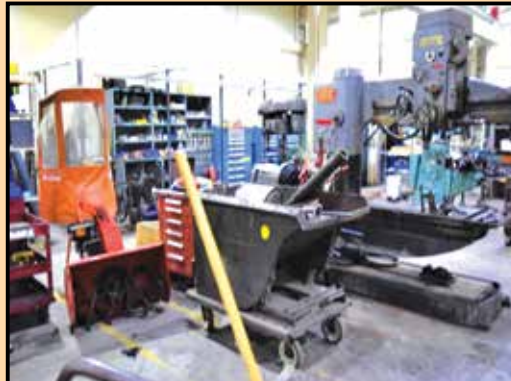
View of FOSDICK Radial Arm Drill, Snow Thrower & Miscellaneous