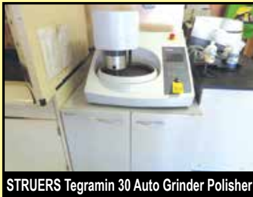
STRUERS Tegramin 30 Auto Grinder Polisher