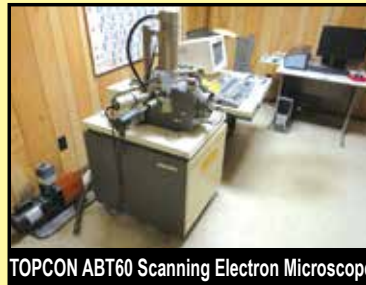
TOPCON ABT60 Scanning Electron Microscope