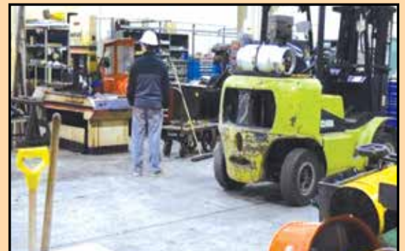
CLARK LP Pneumatic Tire Fork Lift