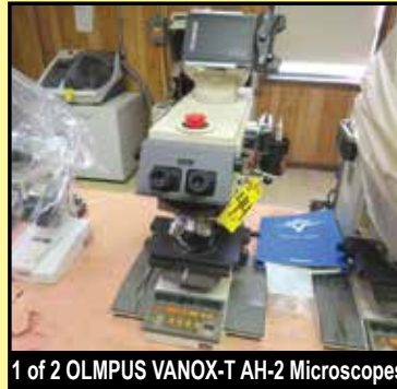
1 of 2 OLYMPUS VANOX-T AH-2 Microscopes