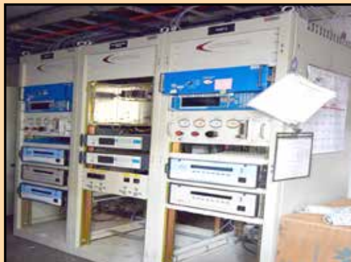
Partial View of Control Center