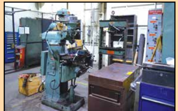
View of BRIDGEPORT Vertical Mill & DAKE Hydraulic Press