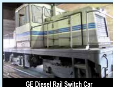
GE Diesel Rail Switch Car