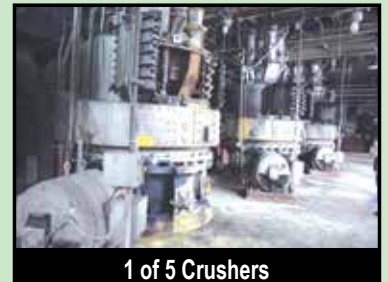
1 of 5 Crushers

#3 – PORTLAND (PA) Sale: Friday, November 1st – Thursday, November 7th • Inspection: Friday, November 1st from 9:00AM-2:00PM