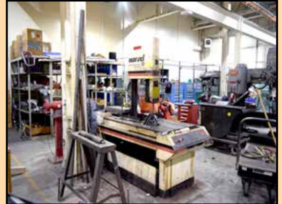
MARVEL Series 8 MARK II Vertical Band Saw