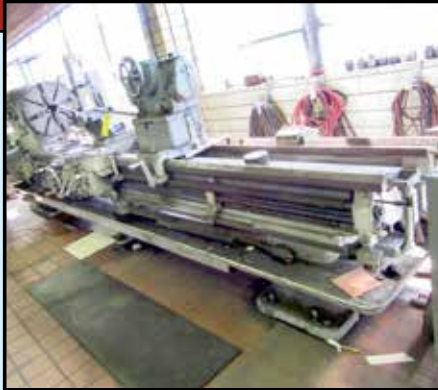
LODGE & SHIPLEY 20' x 30' Engine Lathe

CATERPILLAR D9R Crawler Dozer, S/N 99C06529 • KAWASAKI 95Z11 (S/N SKW8-159) Articulating Rubber Tire Loader • DRESSER TD-25G Crawler Dozer (S/N 75894) • P & H R150D Rough Terrain 15 Ton Truck Crane • GE Diesel Rail Switch Car, Class B-B-00/100-2GE763 300 HP • ROSS Man Lift • VESTIL 4500 LB Electric Pallet Jack • CLARK Fork Lift •