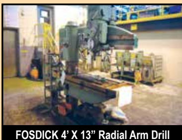
FOSDICK 4' X 13" Radial Arm Drill

#3 – PORTLAND (PA) Sale: Friday, November 1st – Thursday, November 7th • Inspection: Friday, November 1st from 9:00AM-2:00PM