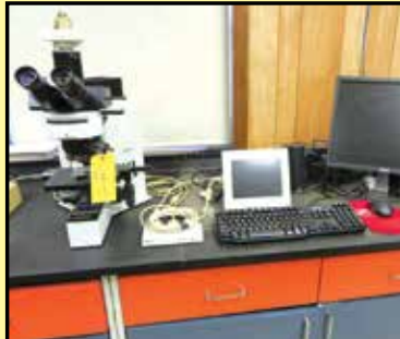
OLYMPUS BX60MF Binocular Microscope

FORD A-64 Articulating Rubber Tire Loader w/Bucket & Forks; YALE 6000 LB Electric Fork Lift