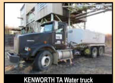
KENWORTH TA Water truck

#4 – NILES (OH) Sale: Friday, November 8th – Thursday, November 14th • Inspection: Friday, November 8th from 9:00Am-2:00PM