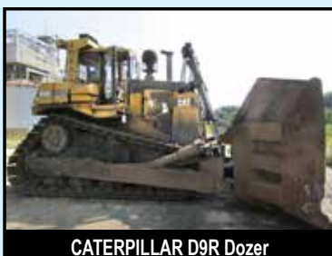
CATERPILLAR D9R Dozer