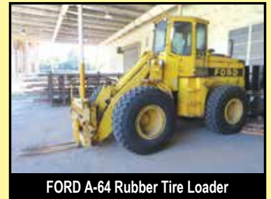
FORD A-64 Rubber Tire Loader

#2 – ELRAMA (PA) Sale: Friday, October 18th – Thursday, October 24th • Inspection: Friday, October 18th from 9:00AM-2:00PM