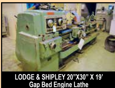
LODGE & SHIPLEY 20"X30" X 19' Gap Bed Engine Lathe