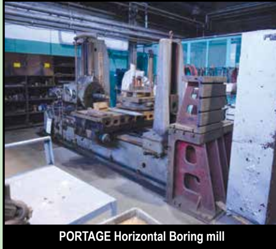
PORTAGE Horizontal Boring mill

• Stakebody Plow Truck w/Bed Salt Spreader •