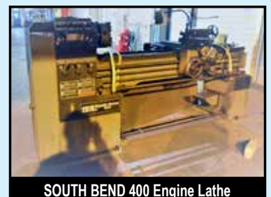
SOUTH BEND 400 Engine Lathe

... Auctioneers | Appraisers | Liquidators