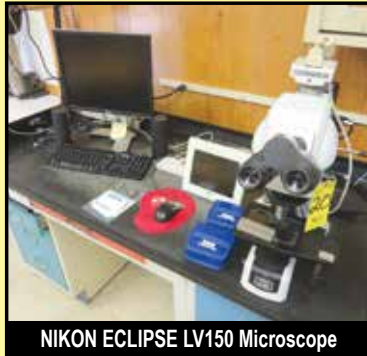
NIKON ECLIPSE LV150 Microscope