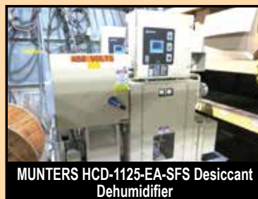
MUNTERS HCD-1125-EA-SFS Desiccant Dehumidifier