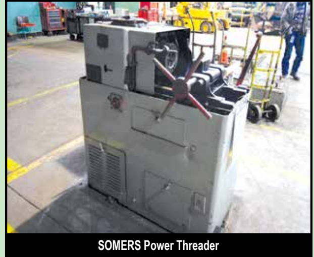
SOMERS Power Threader