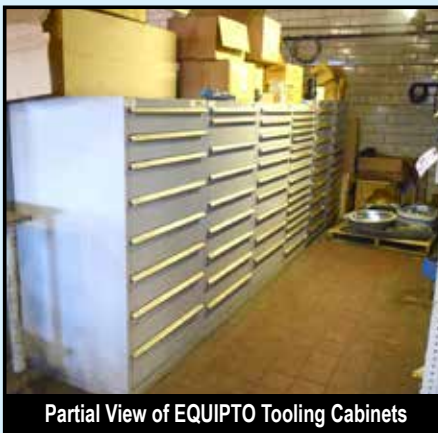
Partial View of EQUIPTO Tooling Cabinets

Tools, Rigging Equipment, Slings Safety Equipment, Electrical, Plumbing & Contractor's Tools & Supplies, GREENLEE 1801 & 1800 Benders • OPTALIGN , Meters, Testers, Welding Supplies & Equipment, GOLDSTAR 452 Tig & HOBART Mig Welders, LINCOLN Ranger Gas Welder/Generator & IDEALARC Tig Welder • Tool Boxes, Hardware & Cabinets • OSTER 744 Power Threader • Clamps, Vises, Carts, Ladders, Steam Cleaner, Chains, Slings, Burning Outfits, Power Tools, Gang & Job Boxes •