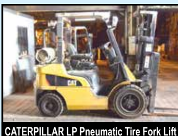
CATERPILLAR LP Pneumatic Tire Fork Lift

#4 – NILES (OH) Sale: Friday, November 8th – Thursday, November 14th • Inspection: Friday, November 8th from 9:00Am-2:00PM