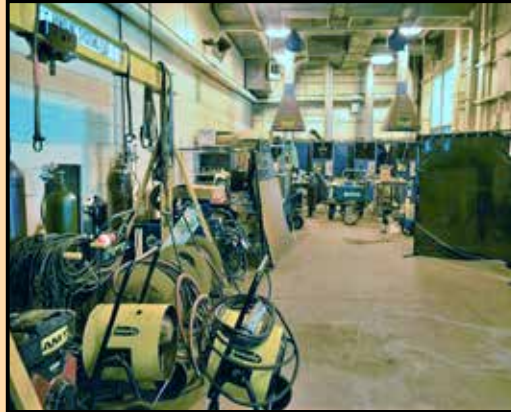
Partial View of Welding Shop