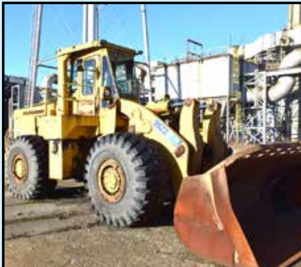
KAWASAKI 95Z11 Rubber Tire Loader

LODGE & SHIPLEY 20'x30' & SOUTH BEND Lathes • CINCINNATI BICKFORD 3' Arm x 10" Column Radial Arm Saw • 16" & 12" HD Dbl. End Grinders • DAKE 50H Hydraulic Press • WILTON 7"x12" Belt & RACINE Hack Saws • BUFFALO 22" & ROCKWELL 15" Drill Presses • (15+) EQUIPTO Tooling Cabinets, Tooling, Drills, Taps, Dies, etc., DUMORE Tool Post Grinder, KENNEDY Tool Boxes, Inspection (Mics, Gages, etc.) Mag Drill, DAYTON Sand Blast Cabinet, HD 4' Power Squaring Shear, 3/8", DELTA Carbide Grinder •