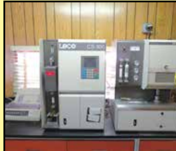
LECO CS-300/HF-300 Carbon Sulfur Analyzer