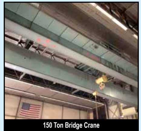
150 Ton Bridge Crane