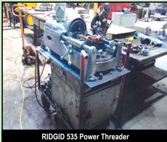
RIDGID 535 Power Threader