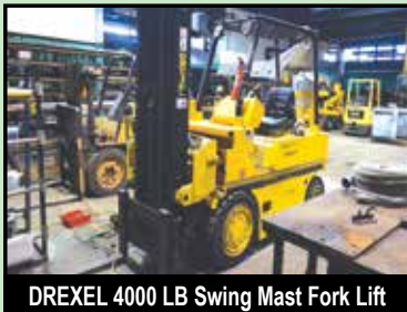
DREXEL 4000 LB Swing Mast Fork Lift

#2 – ELRAMA (PA) Sale: Friday, October 18th – Thursday, October 24th • Inspection: Friday, October 18th from 9:00AM-2:00PM