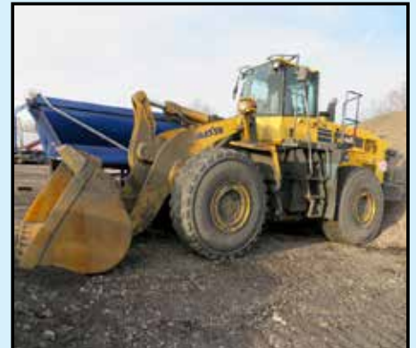
KOMATSU WA500-6 Rubber Tire Loader