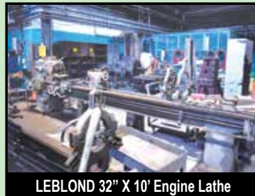
LEBLOND 32" X 10' Engine Lathe