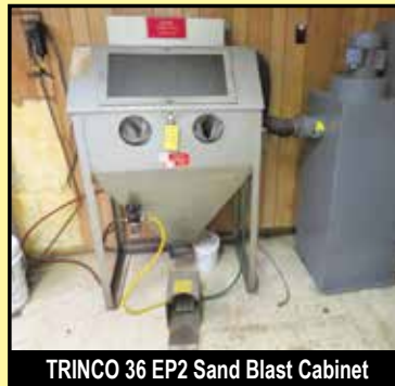
TRINCO 36 EP2 Sand Blast Cabinet