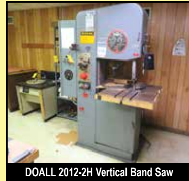
DOALL 2012-2H Vertical Band Saw