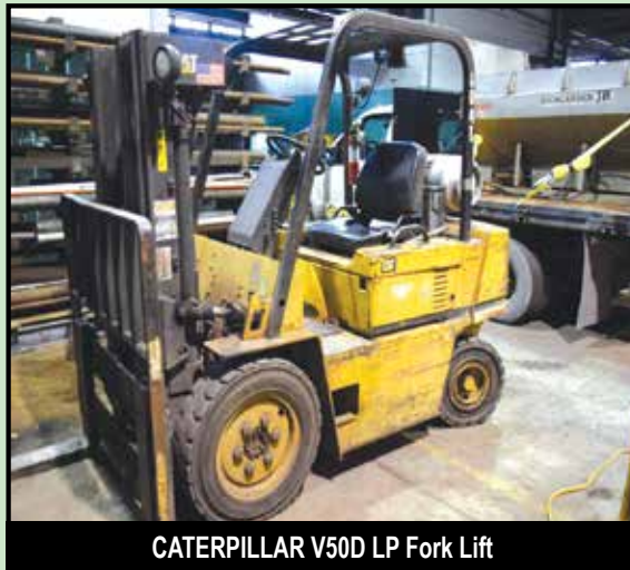
CATERPILLAR V50D LP Fork Lift