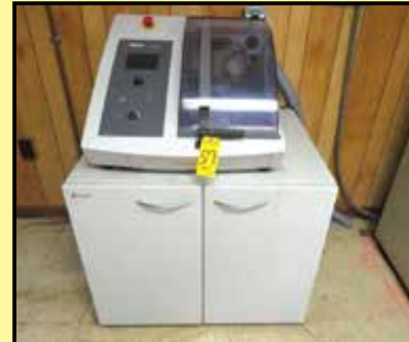
STRUERS Secotom-15 Cut-Off Saw