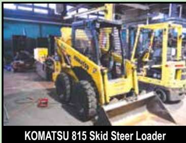
KOMATSU 815 Skid Steer Loader