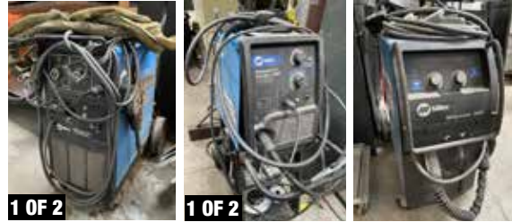
1 OF 2

METAL STOCK, VINYL MATERIAL, CABINETS, TOOLBOXES, FLAMMABLE CABINETS, POWER & HAND TOOLS, SUPPLIES AND RELATED ITEMS