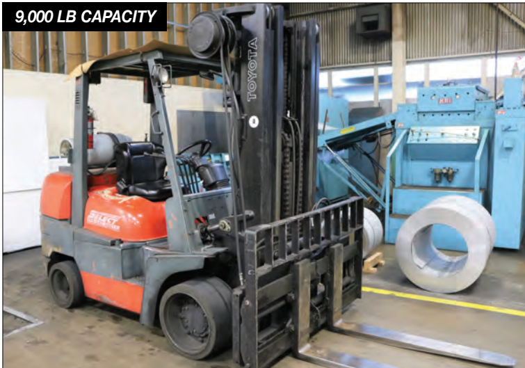
9,000 LB CAPACITY

LOCATION: 2701 SOUTH HARBOR BLVD., SANTA ANA, CA