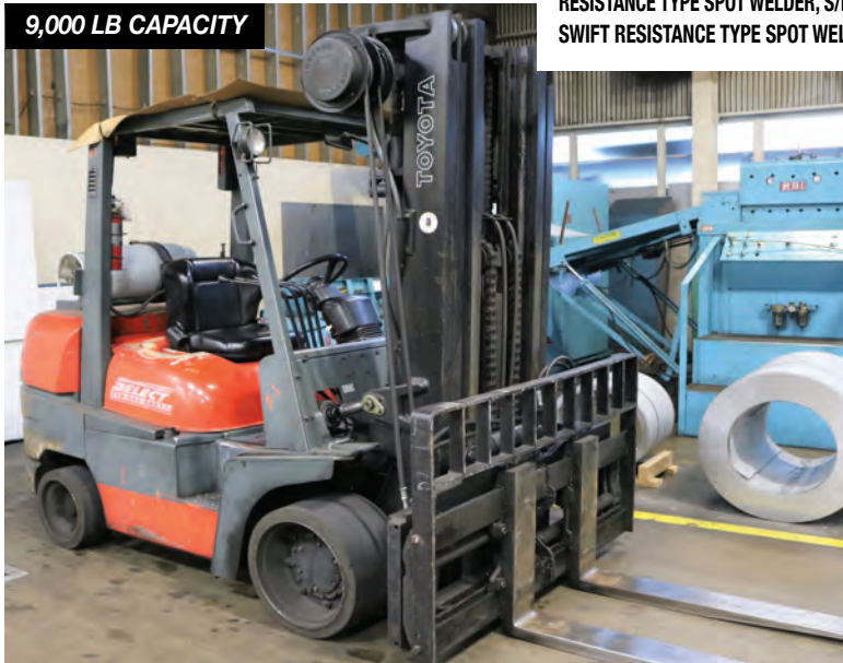
9,000 LB CAPACITY

NISSAN MODEL OT30, 3,000 LB ELECTRIC, S/N M97-70290, BATTERY CHARGER