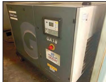
ATLAS COPCO GA18P-A-125FM SCREW TYPE AIR COMPRESSOR

ALSO AVAILABLE: SAFETY LADDER, FIBERGLASS LADDER, PALLET JACK, HAND TRUCKS, LIFTING STRAPS, BARREL DOLLIES, MOVING DOLLIES, SHOP FANS, CANTILEVER RACKING, ROLLING SHOP CARTS, FLAMMABLE LIQUIDS CABINET, PARTS WASHER, SHIPPING SCALES AND MUCH MORE