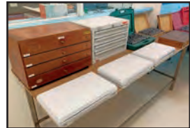
VIEW OF PIN GAGES