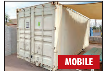
MINI 20' STEEL SHIPPING CONTAINER