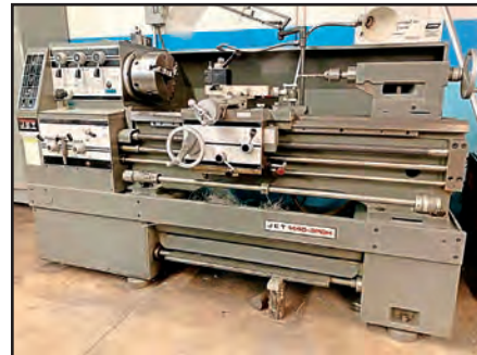
JET 1440-PGH GEARED HEAD GAP BED LATHE