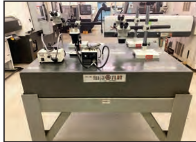
SURFACE PLATE AND MICROSCOPES