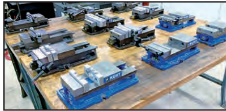
KURT MACHINE VISES

OVER (150) CAT 40, BT40 AND BT35 TOOL HOLDERS, CARBIDE INSERTS, END MILLS, TAPS, DRILLS, BORING BARS, TURNING TOOLS, LIVE TOOL HOLDERS, CHUCKS, LARGE ASSORTMENT OF COLLETS, TOOL POSTS, TILTING T-SLOTTED TABLES AND MORE