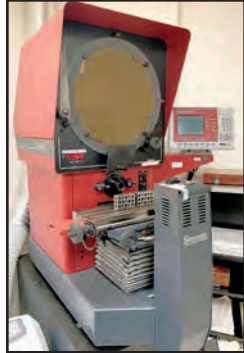
STARRETT HB400 OPTICAL COMPARATOR