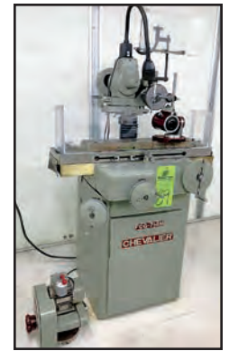
CHEVALIER FCG-714M UNIVERSAL TOOL GRINDER