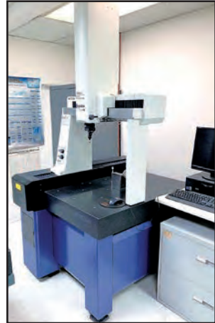
MITUTOYO CRYSTA-PLUS M-574 CMM