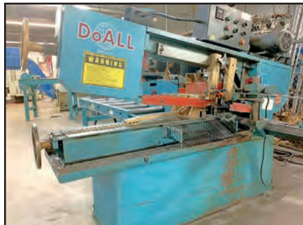
DOALL C-916A HORIZONTAL BANDSAW