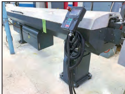
LNS EXPRESS 332 S2 BAR FEED