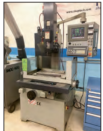
BELMONT MAXICUT ZNC S-26 SMALL HOLE EDM

View our current auction schedule at www.perfectionindustrial.com