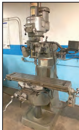
BRIDGEPORT VERTICAL MILL