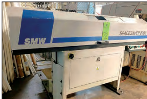
SMW SPACE SAVER 2004 BAR FEED

2004 ROMI CENTUR 30G CNC TURNING CENTER , s/n 002-089649-411, GE Fanuc Oi CNC Control, Collet Chuck, 14.17"-X, 19.68"-Z, 1.625" Max. Machining Dia. (Bar), 4.72" Max. Machining Length