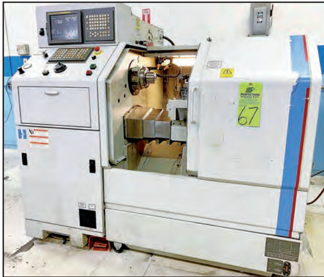
HARDINGE QUEST CHNC42 CNC TURNING CENTER