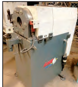
LNS PB-80 CHAMFER MACHINE