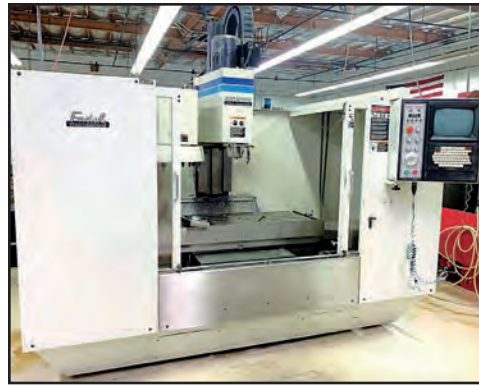
FADAL VMC5020A CNC VERTICAL MACHINING CENTER

MATSUURA MC-510VF CNC VERTICAL MACHINING CENTER , s/n 920709886, Yasnac CNC Control, 15" x 30" Table, BT35 Taper, 20 ATC, 20"-X, 14"-Y, 18"-Z, 8,000 RPM