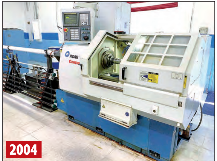
ROMI CENTUR 30G CNC TURNING CENTER