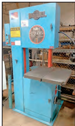
DOALL 2013-V VERTICAL BANDSAW