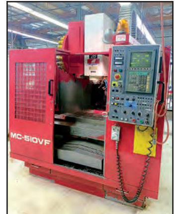
MATSUURA MC-510VF CNC VERTICAL MACHINING CENTER