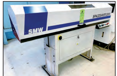
SMW SPACE SAVER 2003 BAR FEED

BELMONT MAXICUT ZNC S-26 SMALL HOLE EDM , s/n 99GBZ26034, CNC Control 13.8"-X, 9.8"-Y x 13.8"-Z, 17.7" x 11.8" x 11.8" Max. Workpiece Size, 330 Lb Workpiece Capacity, CE Marked