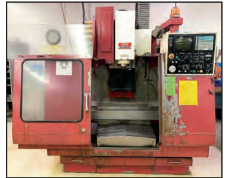
MATSUURA MC-510VS CNC VERTICAL MACHINING CENTER

Sale Closing From: Tuesday, May 21st at 10:00 AM MST