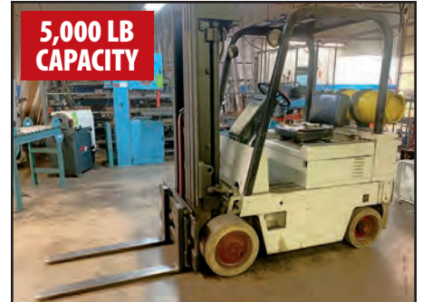
CATERPILLAR T-50 LP FORKLIFT