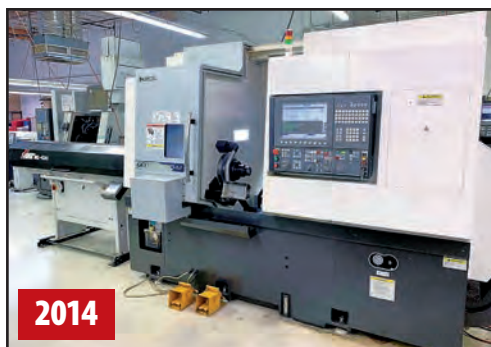
OKUMA GENOS L300-MYW CNC TURNING CENTER

NICHOLS PRECISION – FULL FACILITY CLOSURE