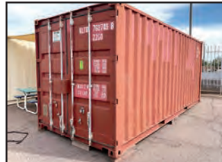
QINGDAO HYUNDAI HP-1CC-1331 20' STEEL SHIPPING CONTAINER