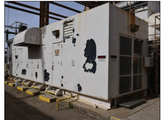
28 TON CAPACITY