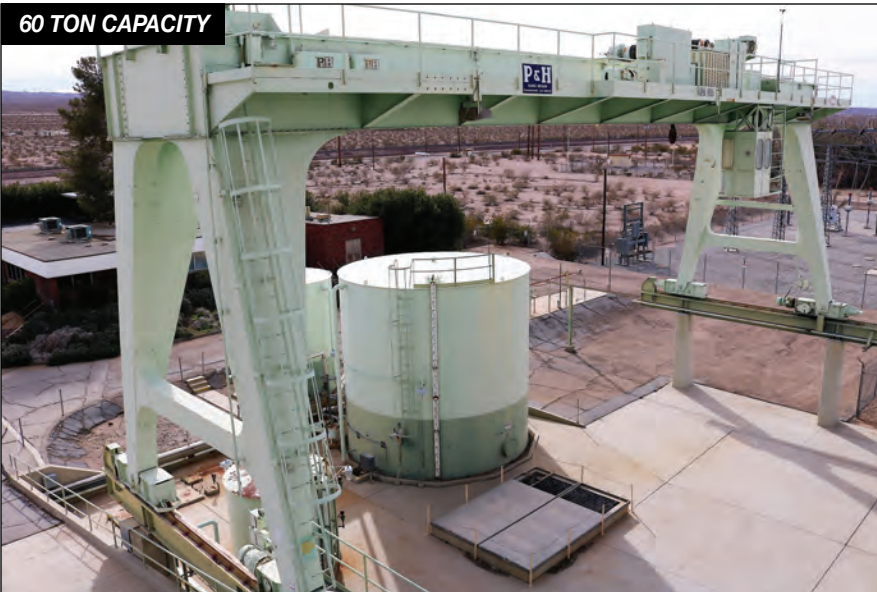
60 TON CAPACITY

LOCATION: 37000 SANTA FE STREET, DAGGETT, CA