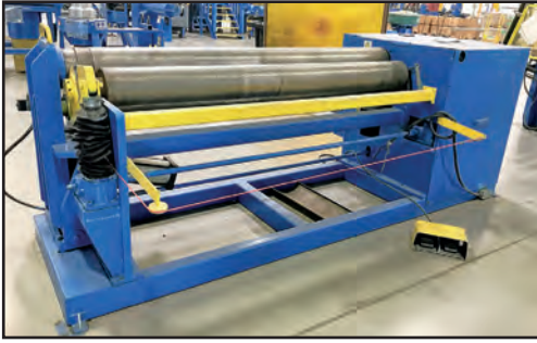
BUILT-RITE NEW DIMENSION P6.250 3-ROLL PLATE BENDING ROLL