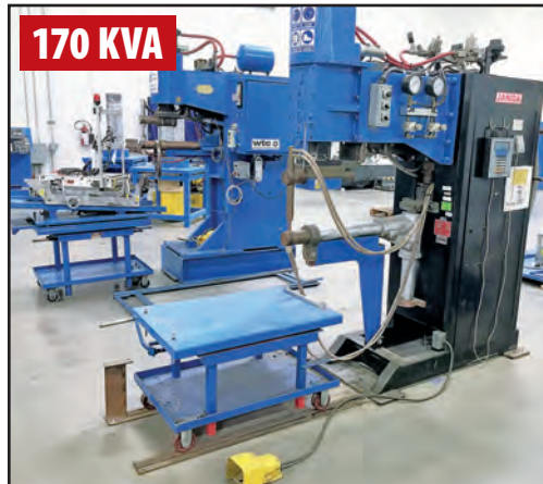
JANDA PMFD317036 SPOT WELDER