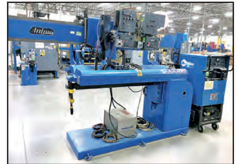
AIRLINE/PERFECTO 48" SEAM WELDER