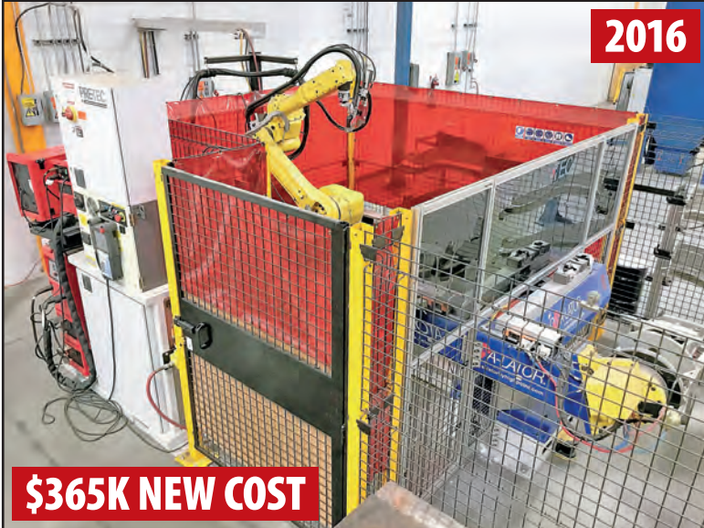
PRE-TEC/FANUC M-201A 6-AXIS ROBOTIC WELDING CELL

50 KVA BANNER 1AP50A12 SPOT WELDER , s/n 4128, w/Technitron T2050 Weld Control