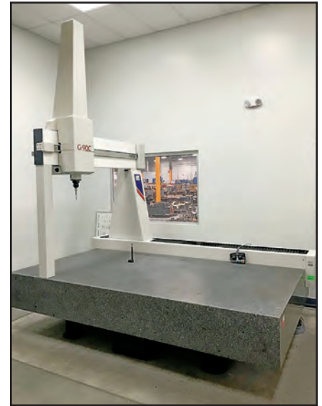
LK G-90C COORDINATE MEASURING MACHINE

2018 FAROARM QUANTUM S 8-AXIS PORTABLE METROLOGY ARM