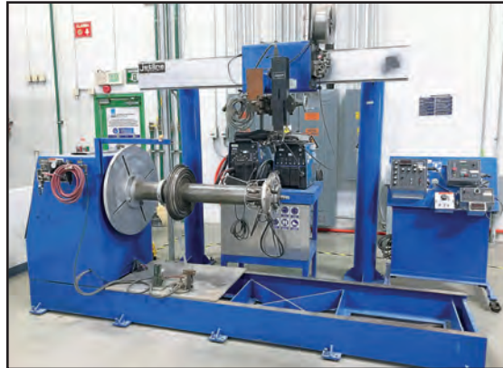
JETLINE ENGINEERING CW5-72Z CIRCULAR WELDER