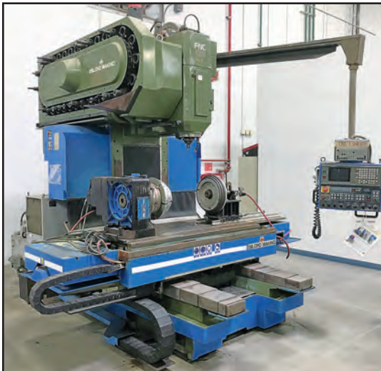
LEBLOND MAKINO FNC128-A30 CNC VERTICAL MACHINING CENTER