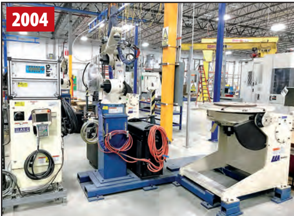
DAIHEN AX-MV6 6-AXIS ROBOTIC WELDING CELL