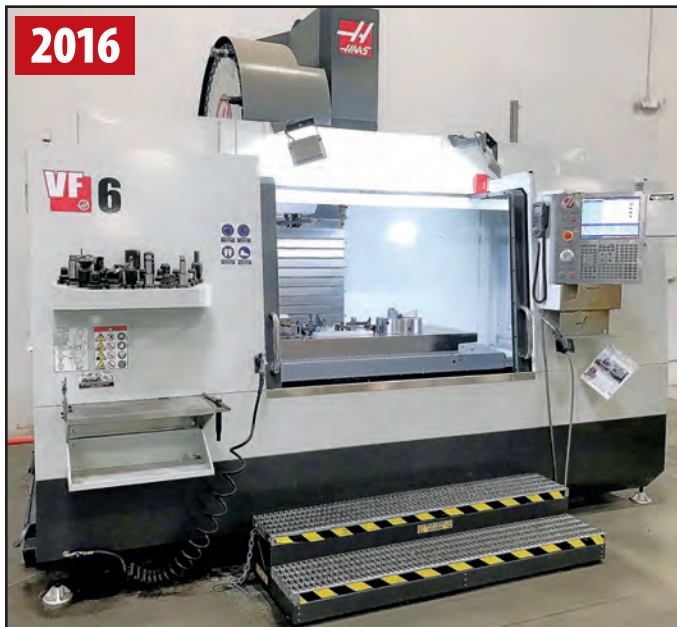
HAAS VF-6/40 CNC VERTICAL MACHINING CENTER

OKUMA & HOWA ACT 35 CNC TURNING CENTER , s/n 00120, Fanuc 18-T CNC Control, 12-Position Turret, 12" 3-Jaw Chuck, 20" Swing, 24" Machining Length, 3,500 RPM