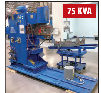
TELEDYNE PEER P-100 SPOT WELDER

View our current auction schedule at www.perfectionindustrial.com