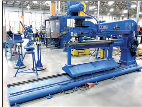
AIRLINE 72" PLANISHER