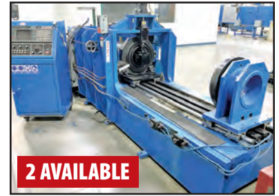
EMR ACRALINE DRUM PUNCH MACHINE