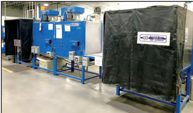
FLUORESCENT PENETRANT INSPECTION LINE