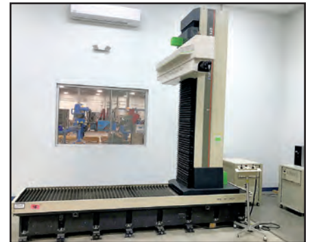
MITUTOYO CHN1612 COORDINATE MEASURING MACHINE