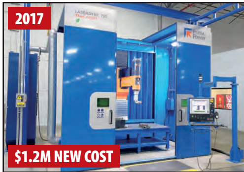
2017 $1.2M NEW COST PRIMA POWER LASERDYNE 795 XL 5-AXIS FIBER LASER

Including: Prima Power 5-Axis Laser Systems, Machining Centers, CNC Turning Centers, Plate Rolls, Shear, Planishers, Longitudinal & Circular Seam Welders, Lincoln & Miller Welders, Robotic Welding Systems, Fume & Dust Collectors, Hydraulic Cake Expanders, CMM's, X-Ray Inspection & Calibration Systems & Much More