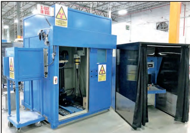
BOSELLO X-RAY SYSTEM