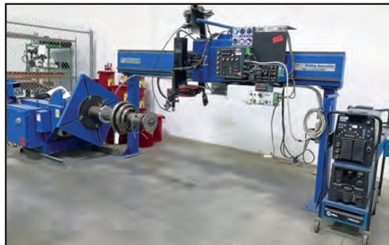
ITW WELDING AUTOMATION CIRCULAR WELDER SYSTEM