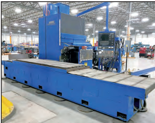
CINCINNATI 20H CINTIMATIC HORIZONTAL MACHINING CENTER

RING EXPANSION LINE COMPRISING (5) RIPPLERS W/MCLEAN HEAT EXCHANGERS, Eaton Vickers Pumps