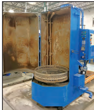
KEMAC INDUSTRIAL HEATED WASH SYSTEM