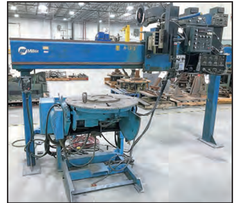
MILLER 9' GANTRY WELDER SYSTEM