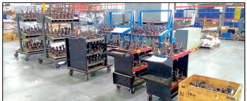
ASSORTMENT OF TOOLING