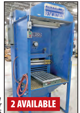
FILTER 1 DOWNDRAFT TABLES

SHIPPING DOCUMENTATION FOR BUYERS OUTSIDE OF MEXICO, MEXICO MAQUILADORA BUYERS AND NON-MAQUILADORA BUYERS WILL BE PROVIDED UPON RECEIVING ALL REQUIRED INFORMATION FROM ALL BUYERS. DOOR-TO-DOOR RIGGING AND SHIPMENT SERVICES OFFERED VIA COMPANIES LISTED ON OUR WEBSITE FOR ALL BUYERS.