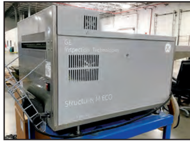
GE STRUCTURIX M ECO X-RAY PROCESSOR