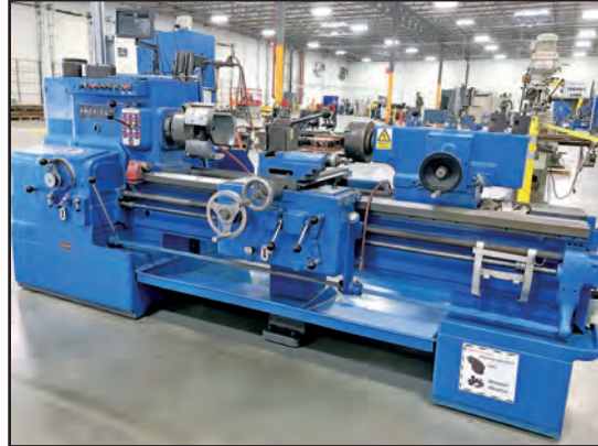
AMERICAN 16" X 54" LATHE W/DRO

ALSO AVAILABLE: (5) DIAMOND GROUND PRODUCTS PIRANHA III TUNGSTEN GRINDERS, DISC SANDERS, AND MORE