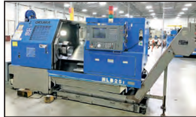
OKUMA LB25II CNC TURNING CENTER