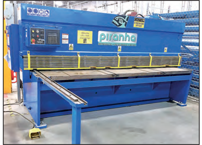
PIRANHA M1/4-10 POWER SQUARING SHEAR