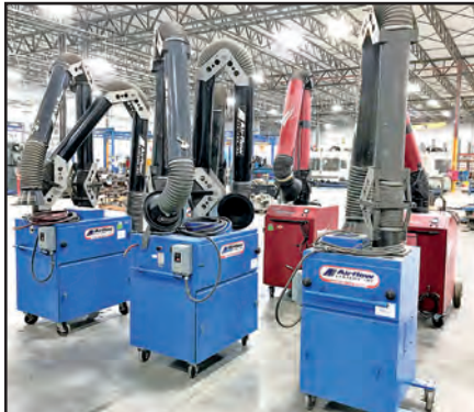
ASSORTED FUME COLLECTION SYSTEMS