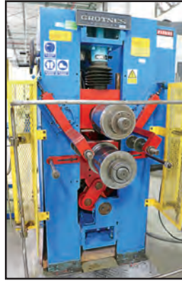
GROTNES C-5700-A 3-ROLL UNIVERSAL BENDER

GROTNES C-5700-A 3-ROLL UNIVERSAL BENDING MACHINE, s/n 0356